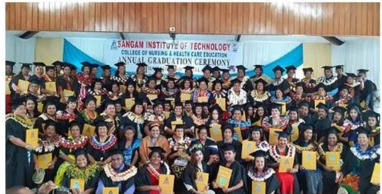
Graduates from Sangam College of Nursing

106 students graduated from Sangam College of Nursing at Suva Sangam Hall in Suva today.