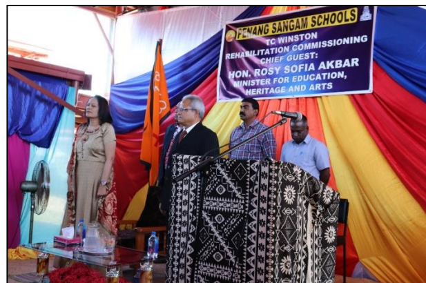
COMMISSIONING OF TC WINSTON REHABILITATED PENANG SANGAM SCHOOLS