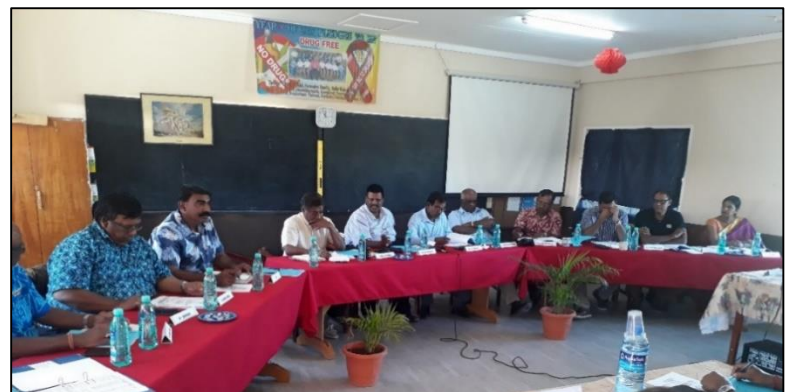
COUNCIL OF MANAGEMENT MEETING IN PROGRESS AT RAVIRAVI