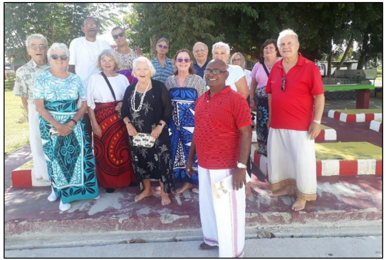
NEW TOUR GUIDE WITH TOURISTS AT THE NADI TEMPLE