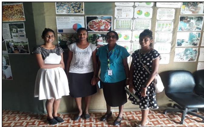
MATHRA SANGAM MEMBERS ATTENDING WORKSHOP ON NCD'S IN LAUTOKA