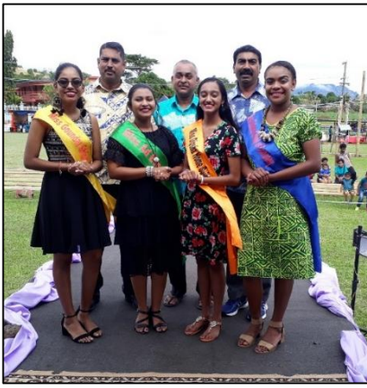
THE 4 QUEEN CONTESTANTS AT THE RAKIRAKI TISI SANGAM CARNIVAL