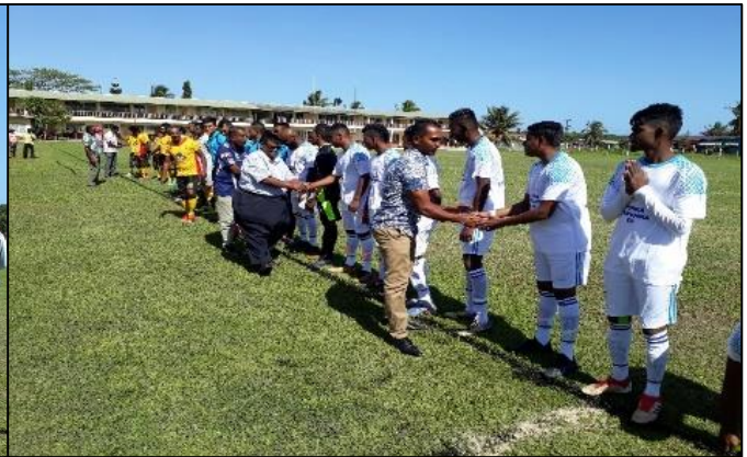
THE NATIONAL PRESIDENT OF TISI SANGAM OFFICIATING THE OPENING OF TIV GAMES IN LABASA