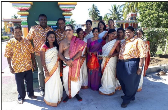
TEMPLE BOARD RECEIVING THE CHIEF GUEST FOR THE OPENING OF THE SARAVANA BHAVAN RESTAURANT

OUR SARAVANA BHAVAN VEGETARIAN RESTAURANT SUPER WEDNESDAY SPECIAL