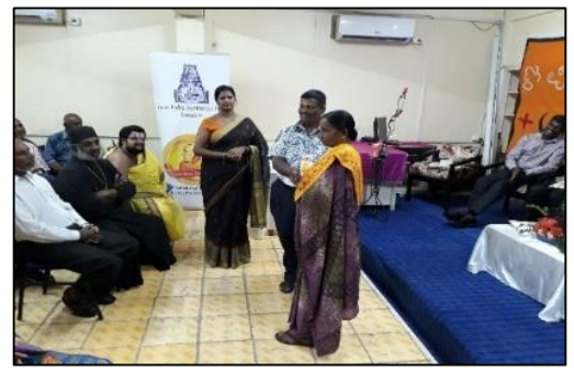
ELDERS OF SANGAM IN LABASA HONORED FOR THEIR SERVICE