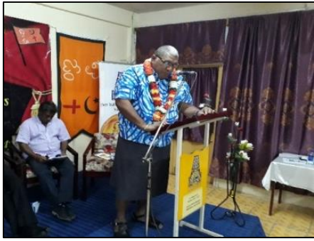
CHIEF GUEST FOR THE SADHU KUPPUSWAMY MEMORIAL LECTURE SERIES- RATU WILIAME KATONIVERE