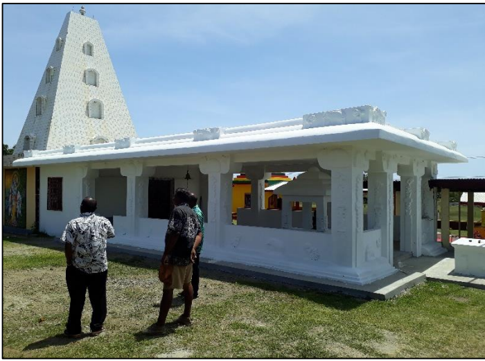
UCIWAI SANGAM TEMPLE RENOVATION WORKS