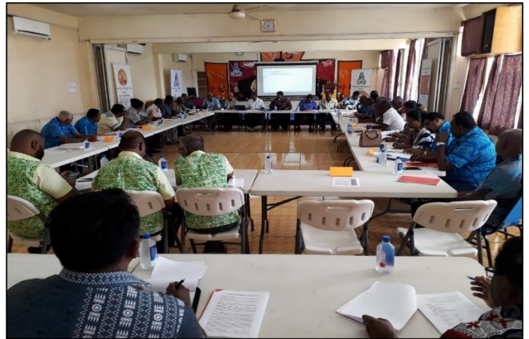
TISI SANGAM FIJI COUNCIL OF MANAGEMENT MEETING IN LABASA: 8 TH SEPTEMBER, 2019