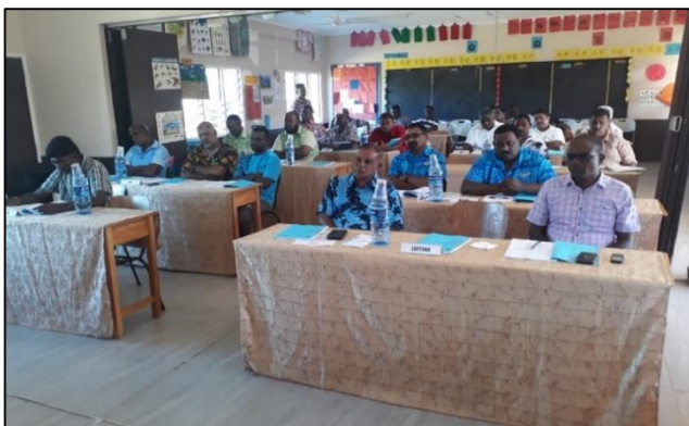
NATIONAL EXECUTIVE BOARD DELIBERATING @ THE COM MEETING

A debrief was convened this year after the Convention in Lautoka with the TIV & the Lautoka district to address some of the issues faced during the convention and look at ways to improve upon them to ensure a better and problem free future conventions. The 2020 Convention is to be hosted by the Nasinu TISI Sangam from the 10 th to 13 th April, 2020.