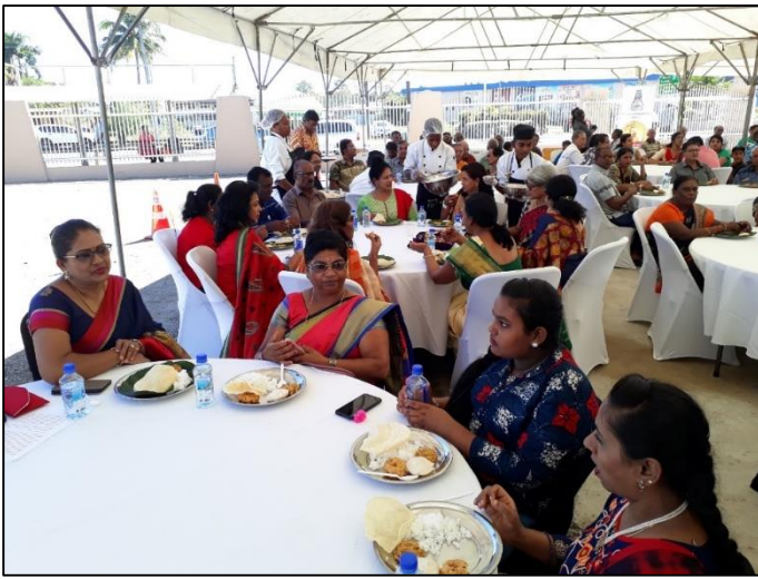
GUESTS SERVED LUNCH @ THE OPENING OF THE SARAVANA BHAVAN RESTAURANT