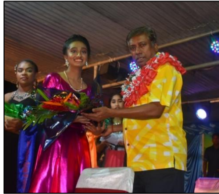
CROWING OF THE QUEEN FOR THE TISI SANGAM CARNIVAL 2019