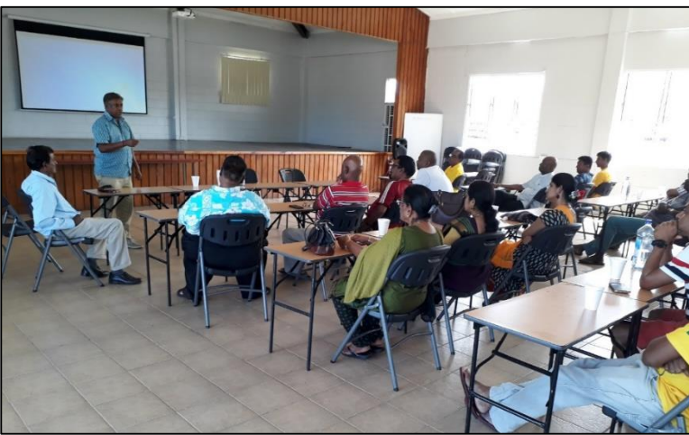
DISTRICT VISITS AND BRIEFING BY SECRETARY GENERAL