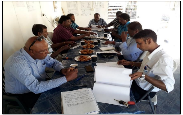
SANGAM CULTURAL COMPLEX PROJECT COMMITTEE MEETING IN PROGRESS