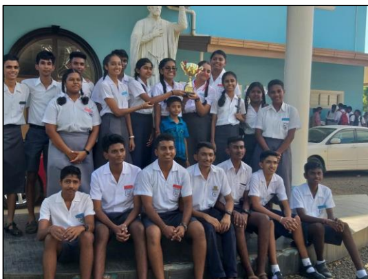
PENANG SANGAM HIGH SCHOOL WINNER OF THE 2018 KAILA COMPETITION

The Youth Climate Summit will feature a full-day of programming that brings together young activists, innovators, entrepreneurs, and change-makers who are committed to combating climate change at the pace and scale needed to meet the challenge. It will be action oriented, intergenerational, and inclusive, with equal representation of young leaders from all walks of life.