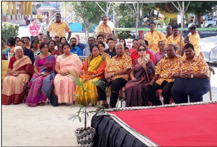
OFFICIAL OPENING OF THE SARAVANA BHAVAN RESTAURANT AT THE SRI SIVA SUBRAMANIAM SWAMI TEMPLE COMPLEX