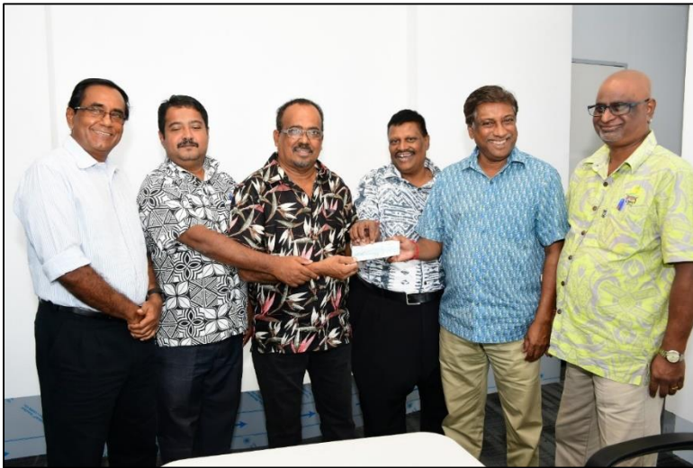
THE TISI SANGAM NATIONAL EXECUTIVES PAYING OFF NASINU LAND PURCHASE FOR THE OWNERSHIP OF 10 ACRE FREEHOLD LAND AT NADAWA NASINU

The board is closely working with the districts to strengthen every district in terms of upgrading their Temples, Schools and properties and at the same time looking at ways to get better returns from our entities.