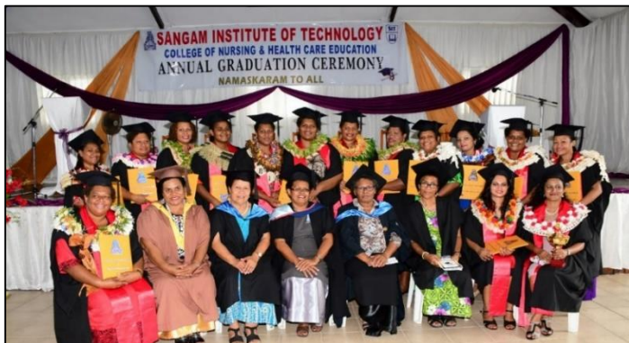
GRADUATION CEREMONY FOR THE SANGAM COLLEGE OF NURSING BRIDGING STUDENTS