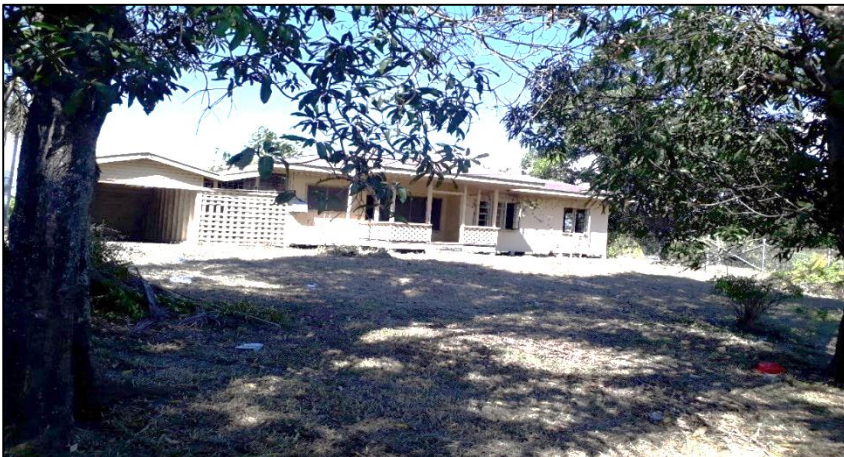
NEW FSC NAVAKAI, NADI PROPERTY ACQUIRED BY TISI SANGAM, FIJI