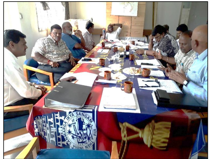
LAND & ESTATES BOARD MEETING IN PROGRESS