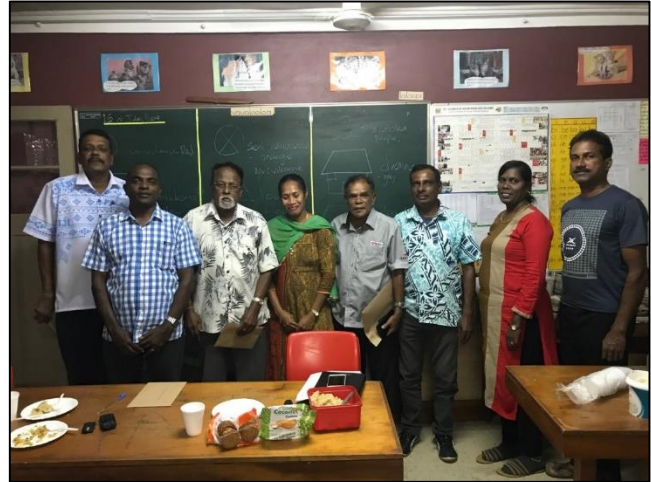
LAUTOKA DISTRICT EDUCATION BOARD