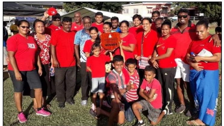
DRUG FREE FAMILY DAY CELEBRATED BY TISI SANGAM RAKIRAKI