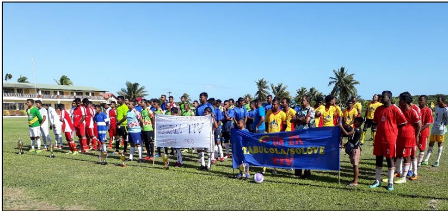
NORTHERN TIV SANGAM SPORTS HOSTED BY LABASA TISI SANGAM FROM 6 TH TO 9 TH SEPTEMBER AT THE SANGAM SKM COLLEGE GROUNDS, NAMARA, LABASA