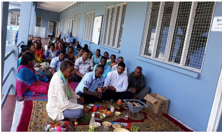
School year beginning Pooja at Penang Sangam for the students