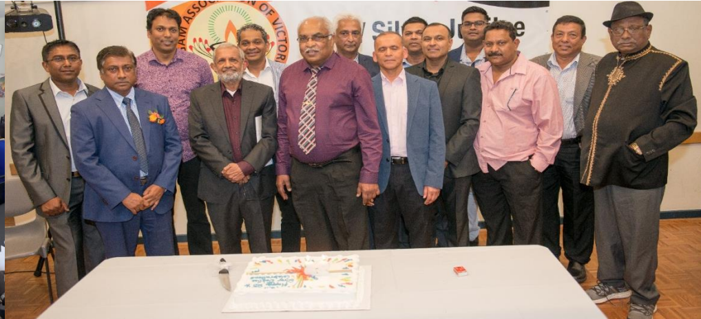
TISI Sangam Fiji Secretary General with President & members of Victoria Sangam during their 25 th Anniversary celebrations in New Zealand