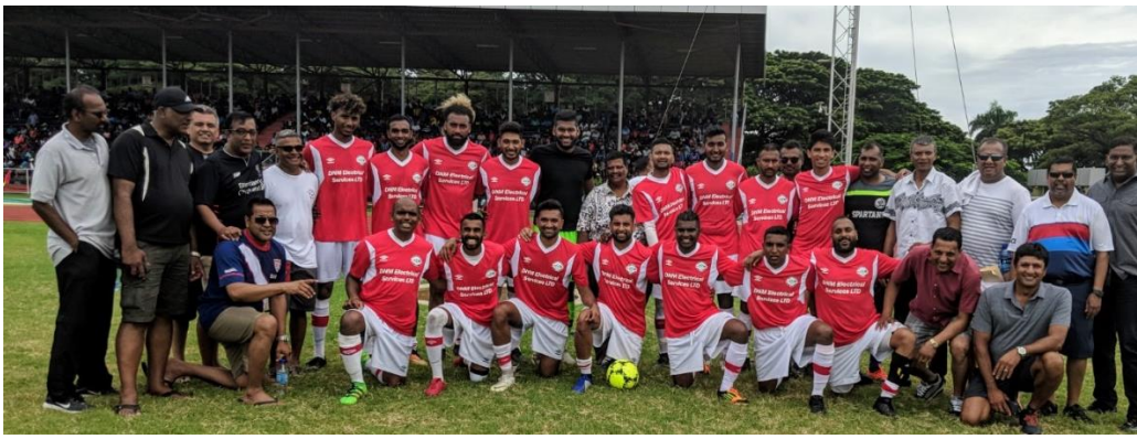
Team North America during their participation at the 2019 convention in Lautoka.