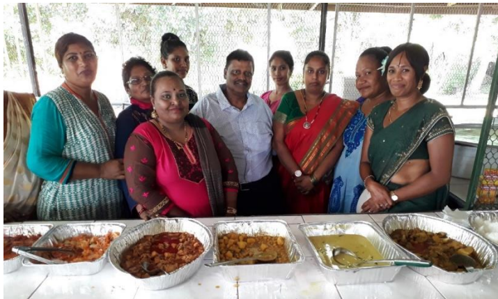
Lautoka Maathar Sangam with National President TISI during the meeting at Lovu Sangam Village