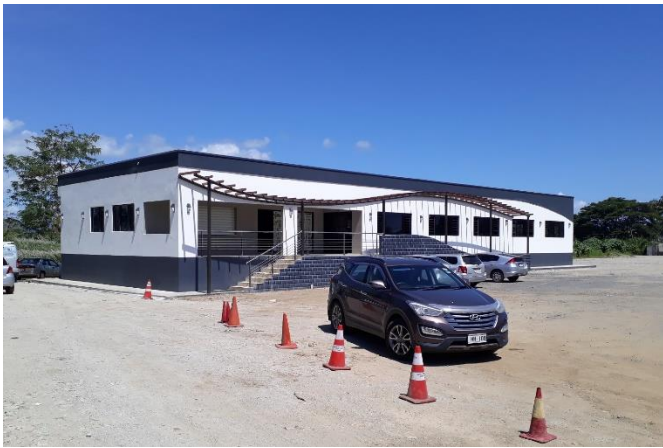
Newly built SARVANA BHAVAN Vegetarian Restaurant at the Sri Siva Subramaniya Swami