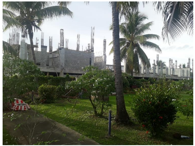
Progress of Sangam Complex works