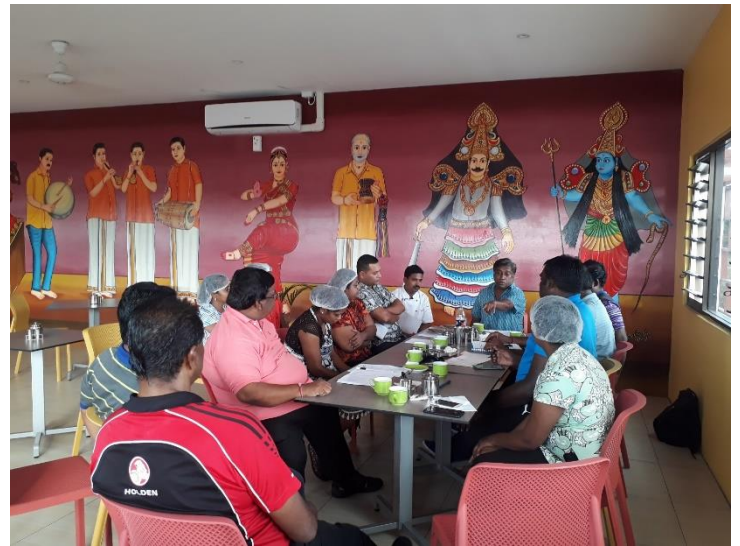
TISI Sangam Secretary General, Vice President South Western with Temple Executive Committee having a discussion with the staffs at the vegetarian restaurant