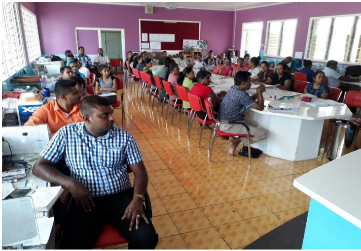
CEO addressing staff at the Labasa SKM College