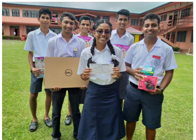
Penang Sangam students with prizes won for the Kaila and Clean Energy Competitions