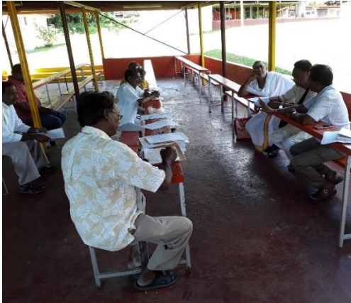
Cultural board meeting with Sangam Priest.

The Committee is to plan for more training and formulating proper guides for the uniform performance of all different rituals as well as prepare a code of conduct for the TISI Sangam Purohits.