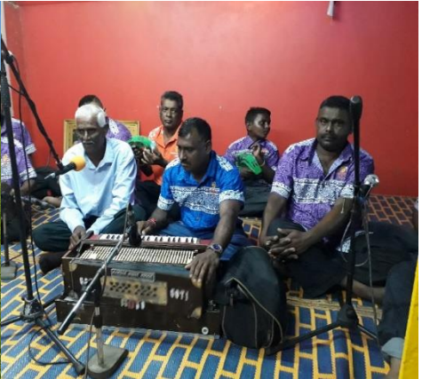
Performance at the Sangam Kritian Samellan