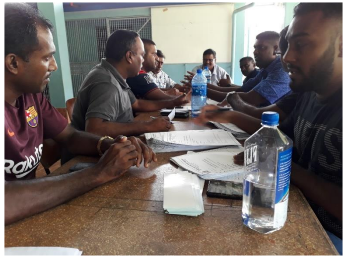
TISI Sangam National Executives having a discussion with the appointed TIV members regarding the convention