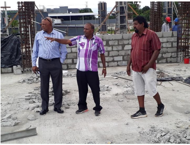
Sangam Cultural Complex supervisors inspecting the site progress.