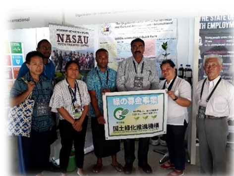
CEO Participating at the 52 nd . ADB workshop