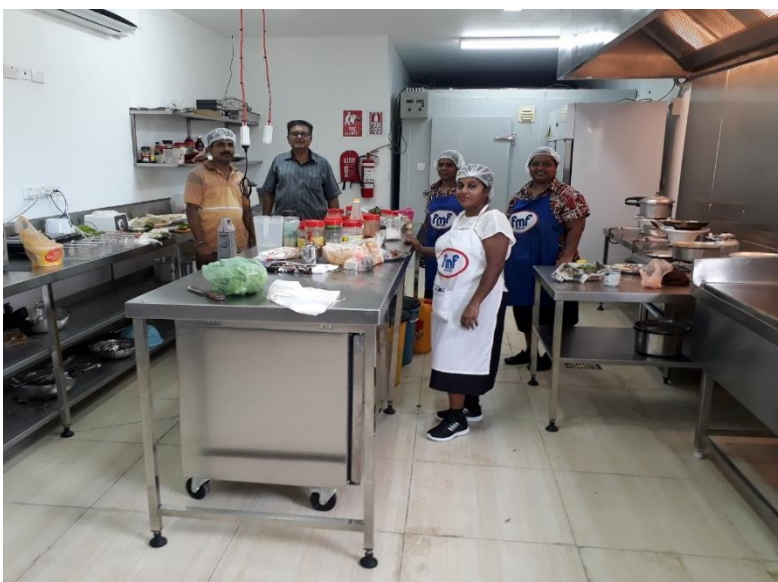
Inside the kitchen of the new vegetarian restaurant