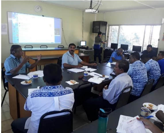
TIV Reforms meeting after the 2019 convention at Nadi SSKM College