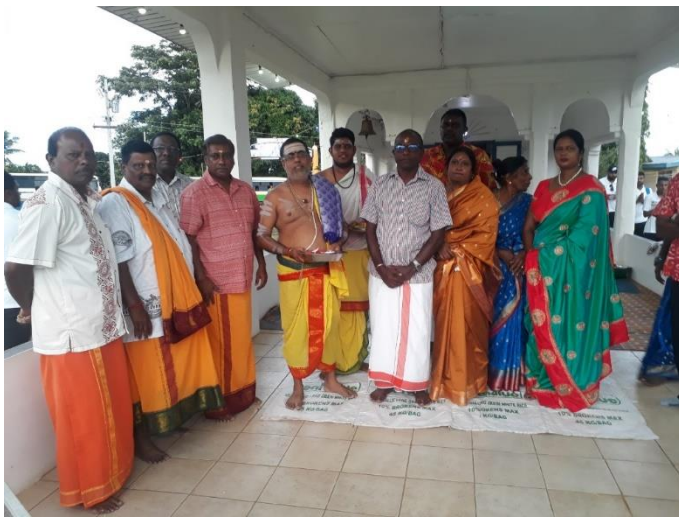
Convention Pooja & Hawan at the Sri Venkateshwar Premal – Lovu Sangam Temple

THEME: Preserving Culture & Values In Strengthening Education