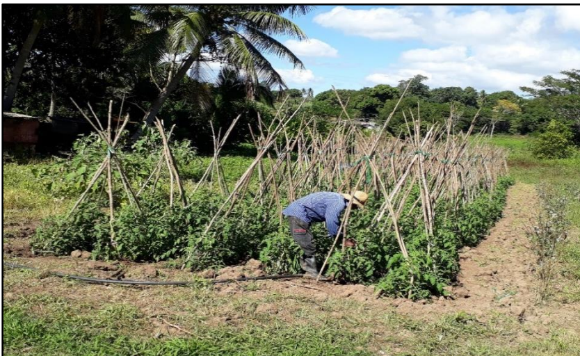
Farm hand at work at the Sangam Nawai Farm, Nadi

We have also engaged the surveyors to undertake survey works to get a proper land lease tile for the press property in order to start development works on this property. There are plans to invest in other properties in Nadi as well as other districts. The board is closely monitoring and dealing with all the project works, land issues as well as looking at the best opportunities to invest in properties.