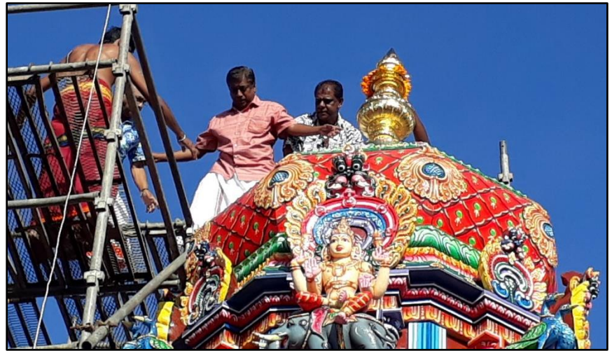
New Kalasam installed