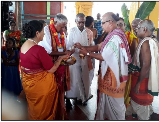
Devotees being blessed by priests