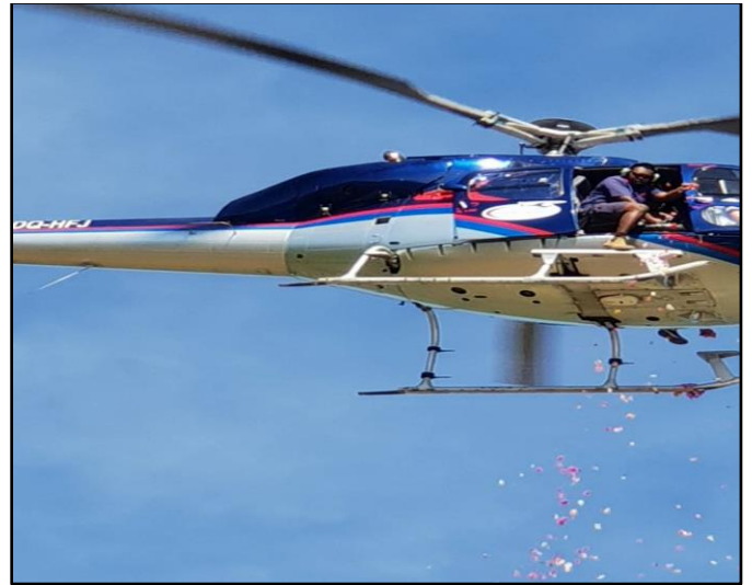
Showering flowers over the Nadi Temple during the Kumba Abhishekam