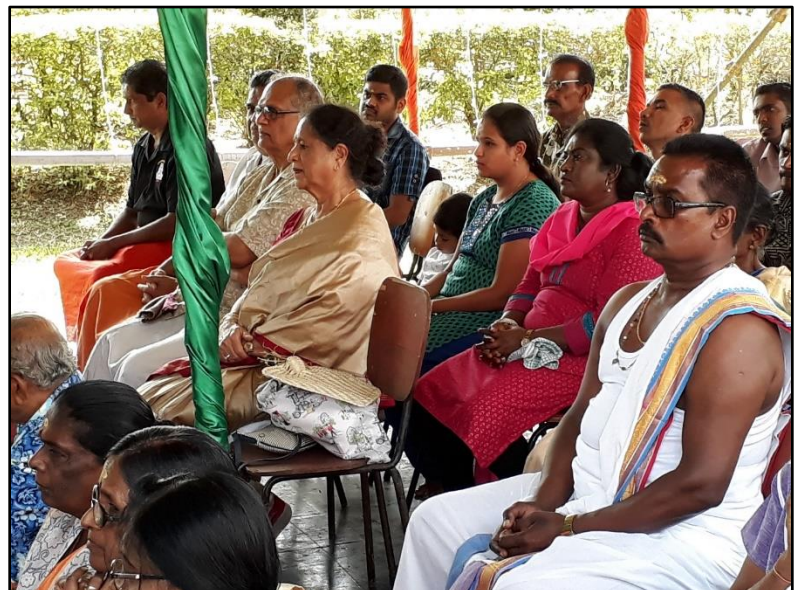
Devotees attending daily Maha Kumba Abhishekam rituals