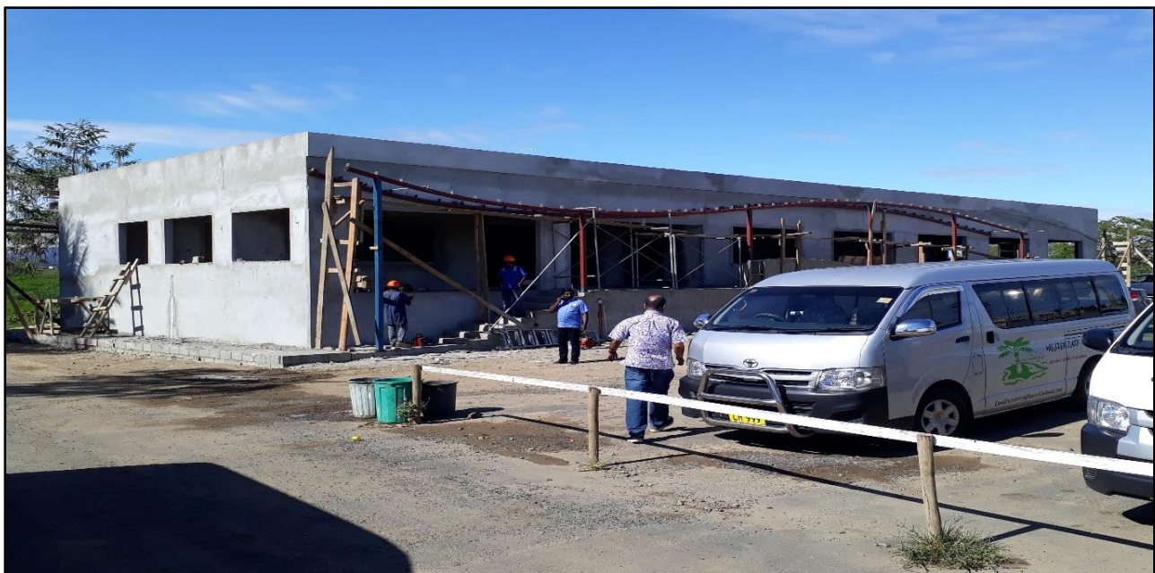
Sri Siva Subramaniya Swami Temple Vegetarian Restaurant nearing completion