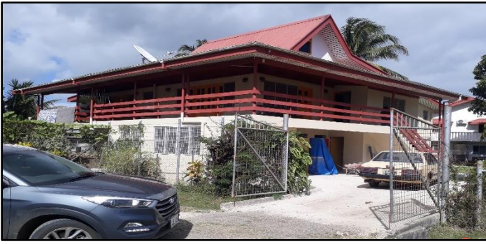
2 x 2 bedroom flat added to the Sangam College Nursing flat in Labasa