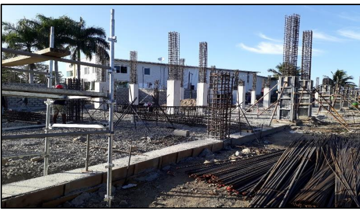
Sri Siva Subramaniya Swami –TISI Sangam Cultural Complex under construction