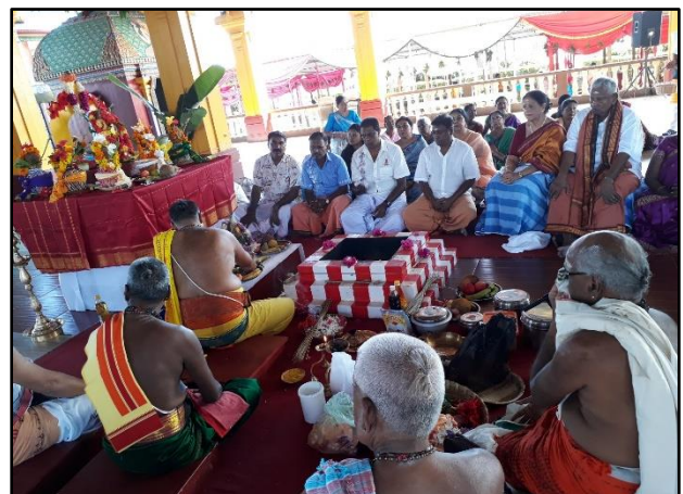
Devasthanam board & National Executives sitting for the homan