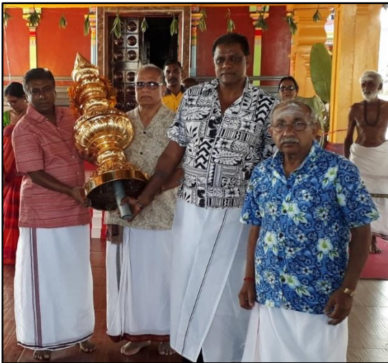
Preparing to install the New Gold Plated Kalasam at the Nadi Temple