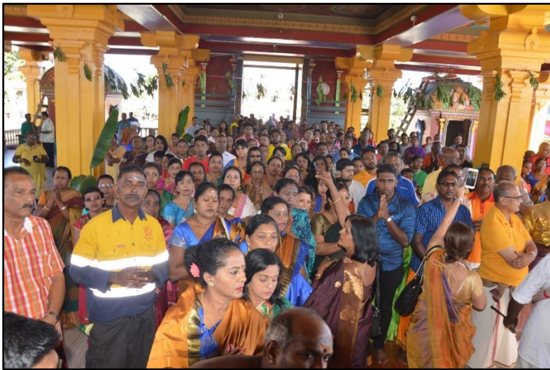
Last day of Maha Kumba Abhishekam