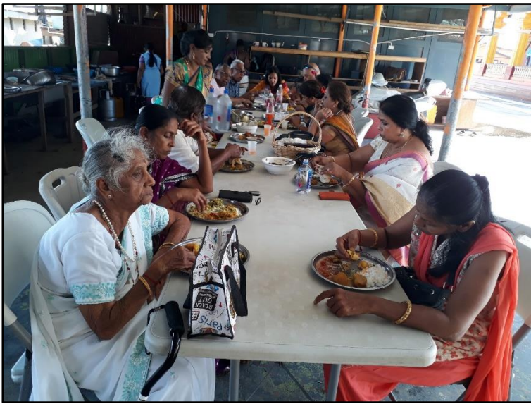
Devotees enjoying their meals at the temple during the Maha Kumbabishekam