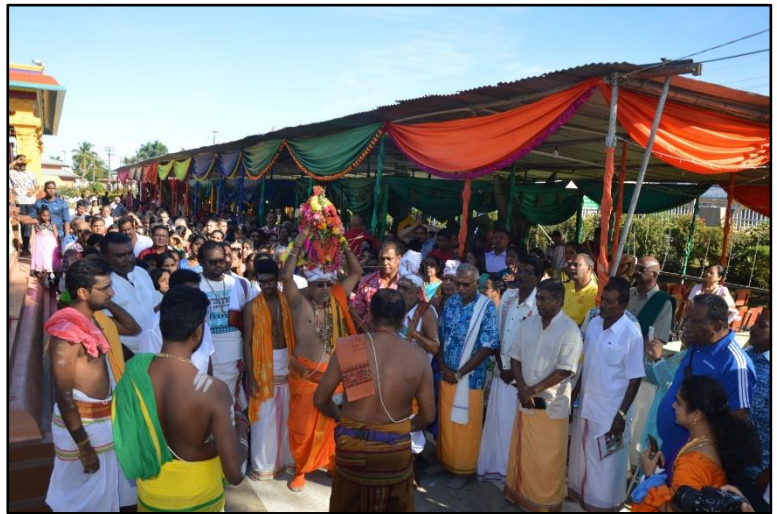
Huge turnout of devotees at the Nadi Temple for the Maha Kumba Abhishekam