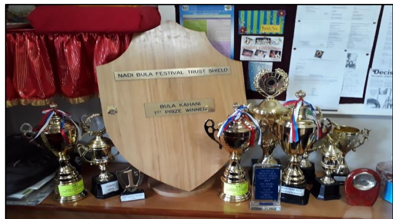
SSMKC Nadi's accomplishments from participation in schools extra-curricular activities