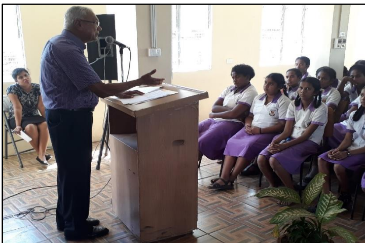
Addressing students at the Ba Sangam College on 17/07/18