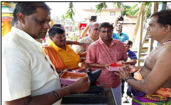
Devotees attending daily Maha Kumba Abhishekam rituals