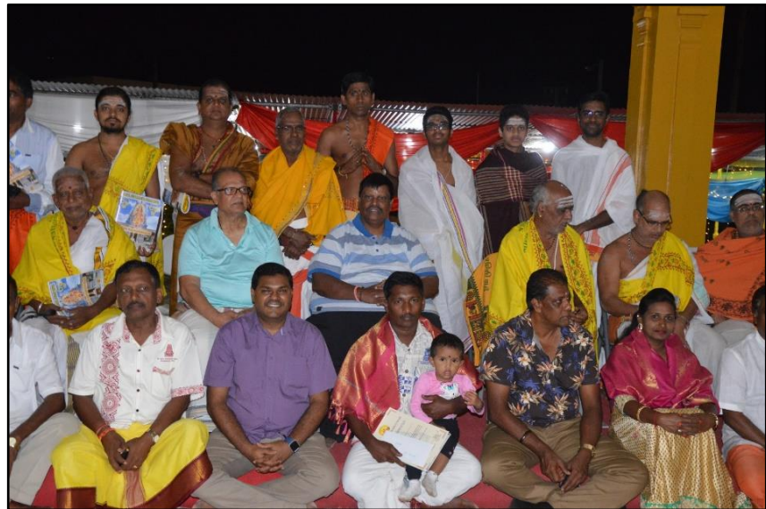
Farewelling the Priests from India