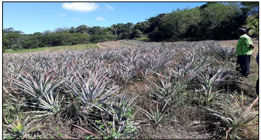
Newly planted pineapples at the Nawai Sangam Farm

The Land & Estates Board had 2 meetings on the 17 th of June and the 8 th of September and dealt with a number of Land matters and projects of Sangam. The Current major decisions had been the purchase of the 2.7 acres FSC Navakai property for Sangam, which is just outside the town next to the main road leading to the Nadi Sports Club. A concept Plan for its development will be undertaken soon. The Madhuvani estate land leases are now in the process of being renewed and necessary decisions are being taken to develop the vacant lots. The Expression of interest has been advertised for the vacant lots that are offered to be leased out.