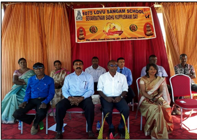
Sangam Founders Day observed at Lovu Sangam, Lautoka