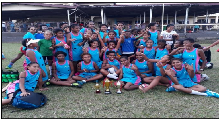
Nasinu Sangam Primary Netball Team