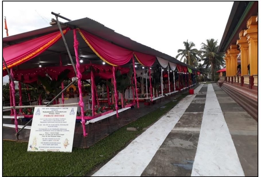
Special preparations for the Kumba Abhishekam homam