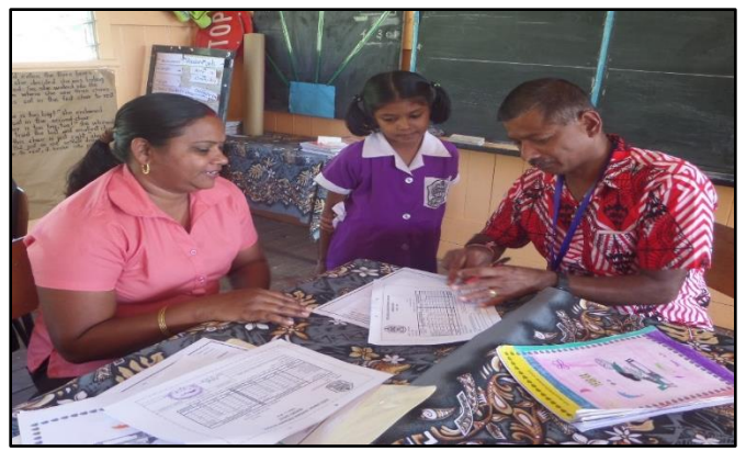
Parent's day at the Labasa Sangam Primary School