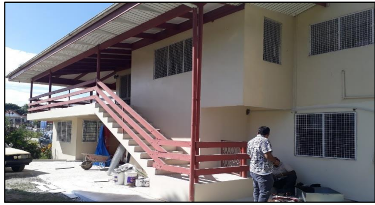
Additional 2 x 2 bedroom flats at the TISI Sangam College of Nursing property in Labasa