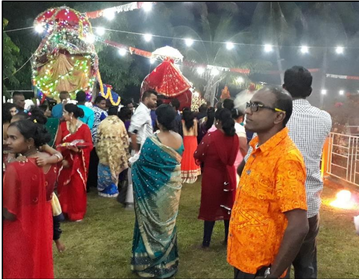
Annual fire walking thirunaal at the Lovu Sangam Temple, Lautoka