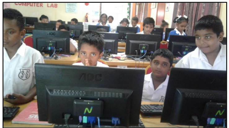
Nadi Sangam Primary Computer Lab