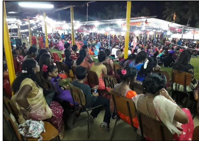
Very large gathering of devotees at the Lovu Sangam Temple