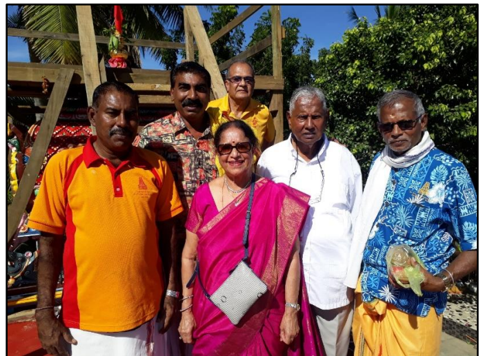
New Kalasam installation at the Sri Ganesha Temple