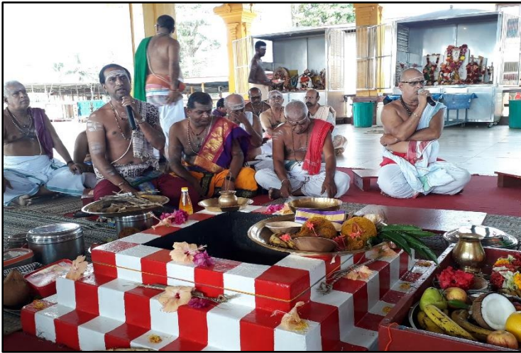
First day of the Maha Kumbabhishekam inaugurated by Senior priests from South India

The Labasa Sangam Swami Venkateshwara Temple has also undergone massive renovation and upgrading, including the full new painting. The next stage of renovation works involving the upgrading of the Pujari’s quarters will also be undertaken. The Suva Sangam Temple is also undergoing renovation and expansion works and is expected to be completed before their Annual firewalling. Navua sangam temple as well as the Lomowai Sangam temples have also been fully renovated and upgraded in the past month.