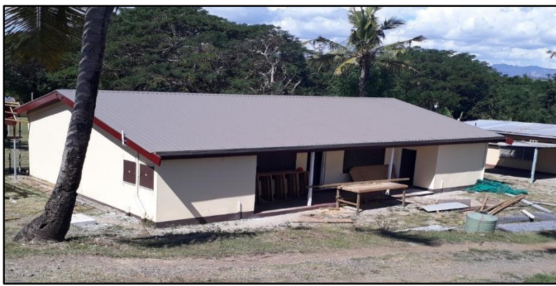
EW ECE building for Ba Sangam Primary after Cyclone Winston