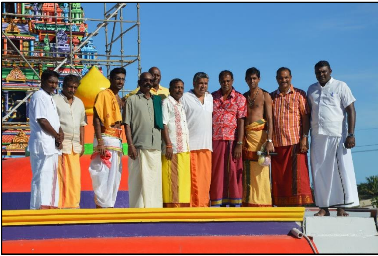
Last day of prayers at the Nadi Temple