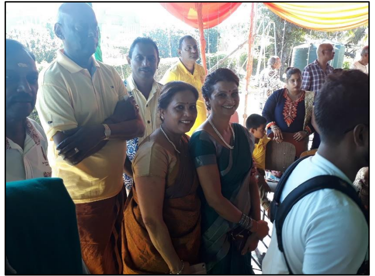
Devotees from around Fiji and abroad