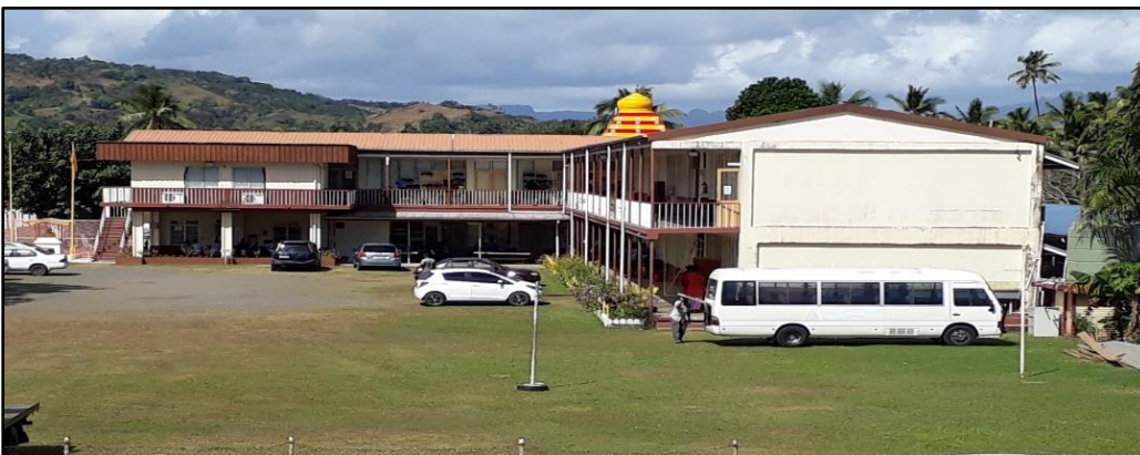
TISI SANGAM COLLEGE OF NURSING MAIN LABASA CAMPUS