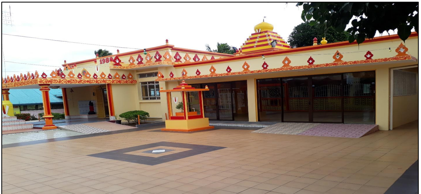
Newly renovated Labasa Swami Venkateshwara Kovil