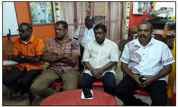
Secretary General and the National Chairman of the Devasthanam Board with the Chairman of the Lovu Sangam temple and the President of TISI Sangam Lautoka