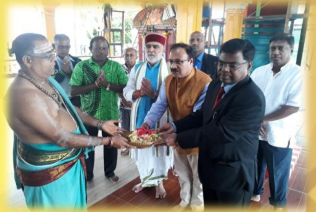
ASHWINI KUMAR CHOUBEY MINISTER OF STATE, HEALTH & FAMILY WELFARE- GOVERNMENT OF INDIA VISIT'S