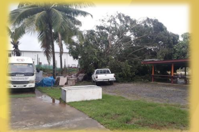
CYCLONE JOSHI'S IMPACT AT THE NADI TEMPLE