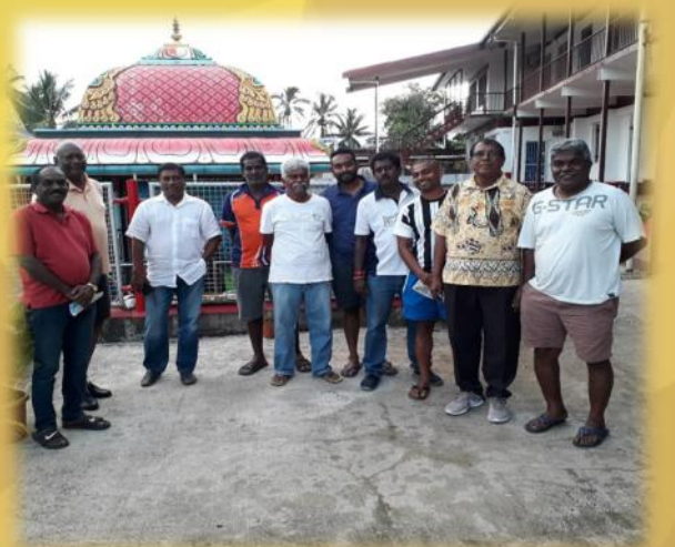
MEETING WITH SUVA TISI SANGAM ON 14th May, 2018.