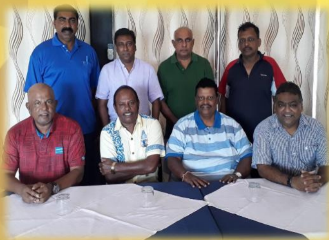
SANGAM FOUNDATION BOARD MEMBERS AT THE FIRST BOARD MEETING IN NADROGA

The Sadhu Kuppuswamy Day will again be observed district wise similar to last year. The Sadhu Kuppuswamy National awards for students excelling in the National Examination will be awarded to students and schools during the Kuppuswamy Day.