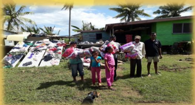
FLOOD AFFECTED FAMILIES IN BA GETTING