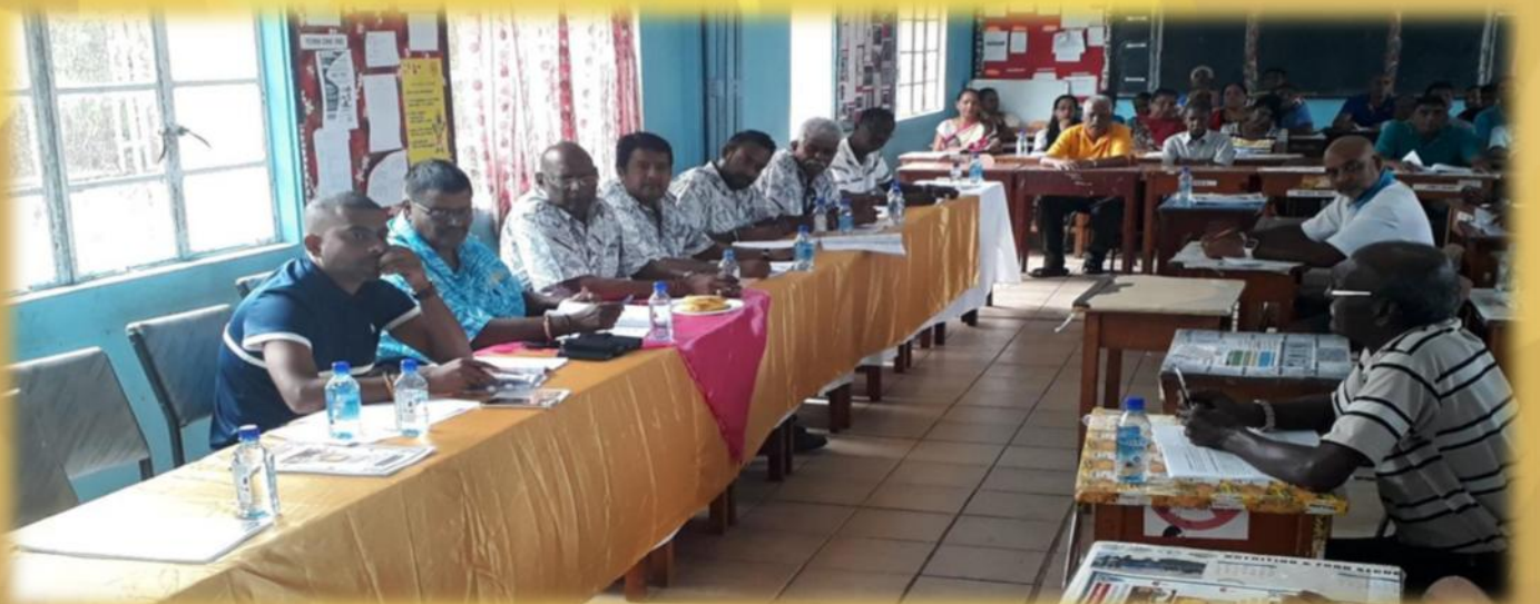
SUVA SANGAM AGM