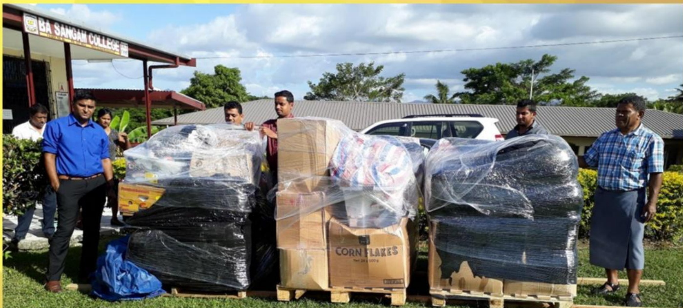
RELIEF ITEMS FOR DISTRIBUTION FROM HAMILTON NZ FOR SANGAM FIJI FOUNDATION