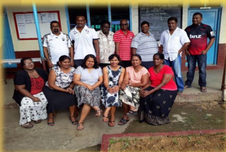
MEETING WITH NASINU TISI SANGAM ON 14th May, 2018 .