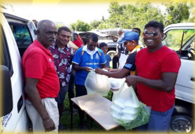
RELIEF WORK IN BA BY TISI SANGAM RAKIRAKI