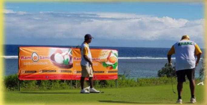
SANGAM, FIJI FOUNDATION CHARITY GOLF UNDER WAY AT NATADOLA GOLF COURSE