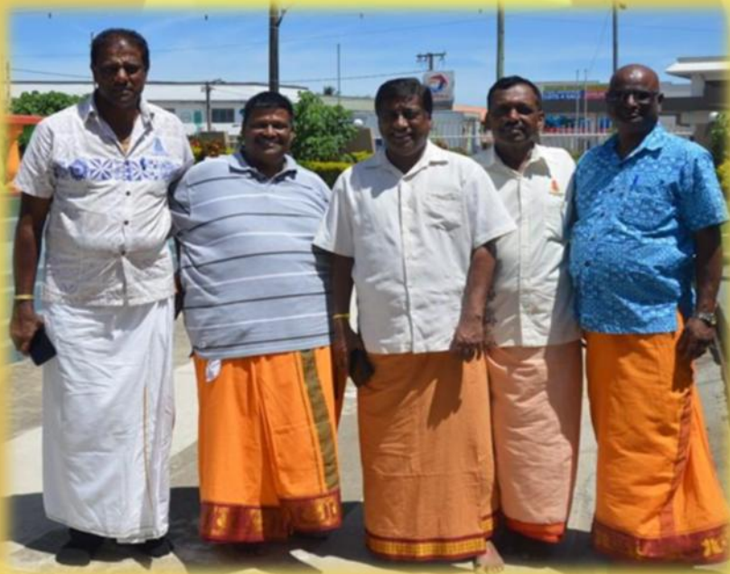
CHAIRMAN DEVASTHANAM BOARD WITH THE TISI SANGAM NATIONAL EXECUTIVES