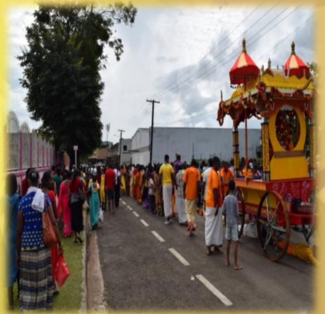
TISI Labasa Vaarshik Brahmotsavam Ratha-Yatra