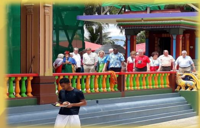
TOURISTS VISITING THE NADI TEMPLE