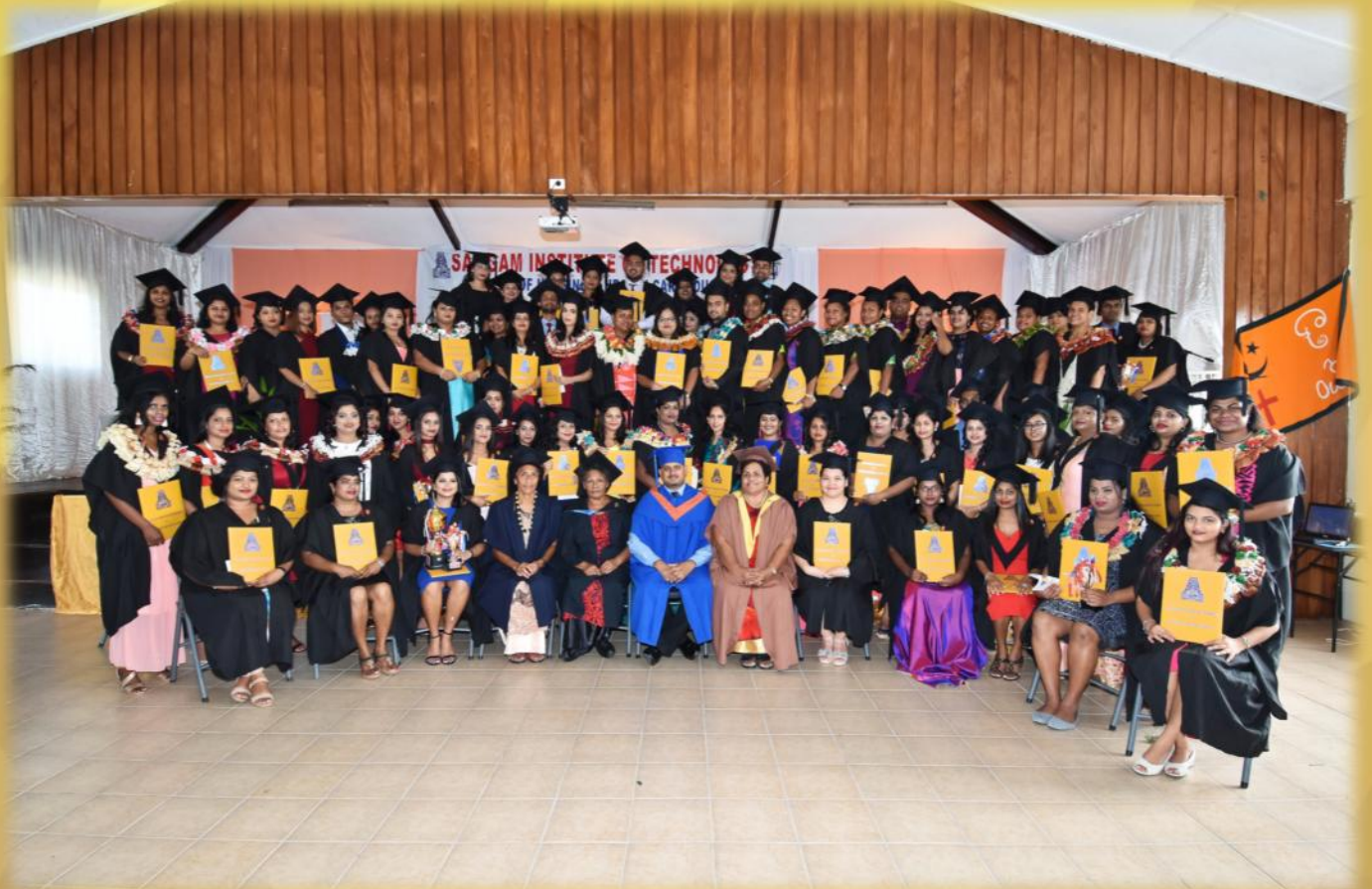
BACHELOR OF NURSING BRIDGING GRADUATION AT SUVE CENTER