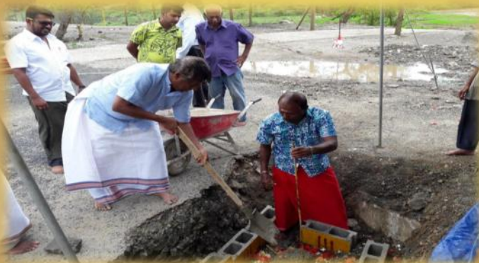
FOUNDATION LAYING FOR THE VEGETARIAN RESTAURANT @ NADI TEMPLE