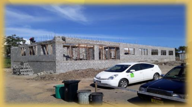
PROGRESS OF WORK AT THE NADI SANGAM TEMPLE VEGETARIAN RESTAURANT