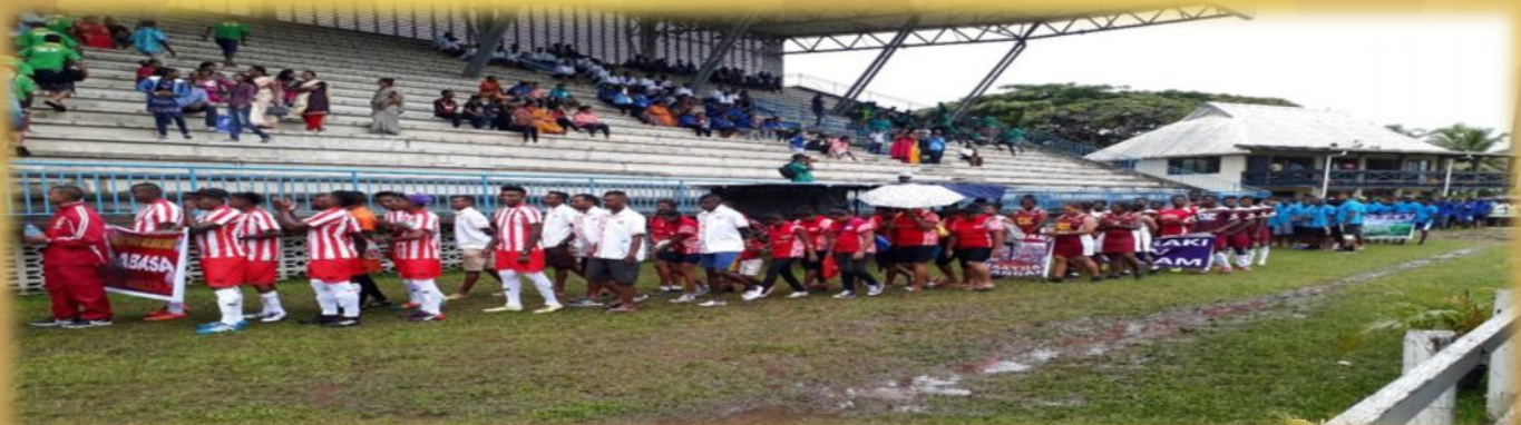
TEAMS PARADING FOR THE OFFICIAL OPENING OF THE 2018 CONVENTION.