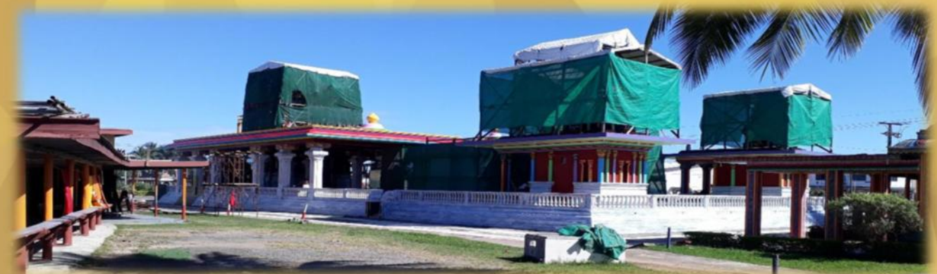
RENOVATION WORKS AT SRI SIVA SUBRAMANIYA SWAMI TEMPLE, NADI