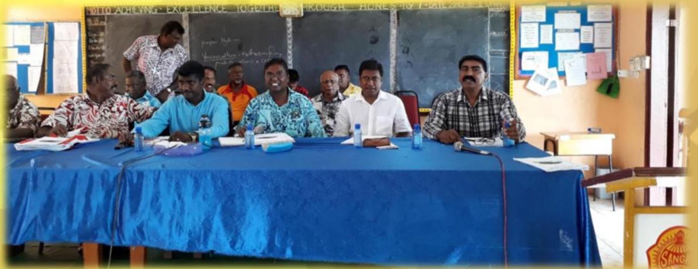
LABASA TISI SANGAM AGM IN PROGRESS

All of the district branches have completed their AGM's.