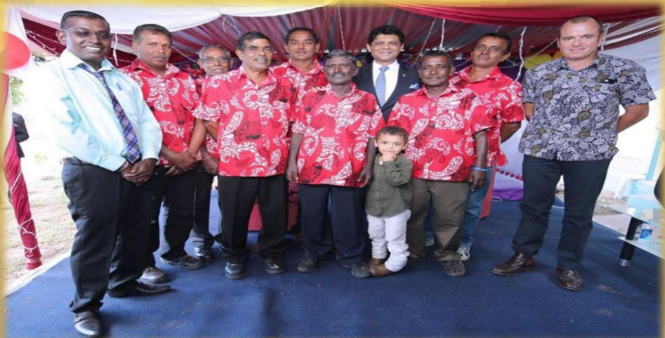
Official opening of Madhuvani sangam school after reconstruction.