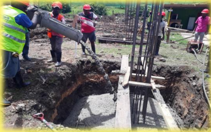
FOUNDATION OF THE SANGAM CULTURAL COMPLEX PROJECT AT THE NADI TEMPLE