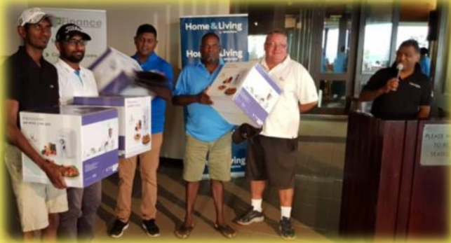
SANGAM FIJI FOUNDATION CHARITY GOLF AT NATADOLA GOLF COURSE