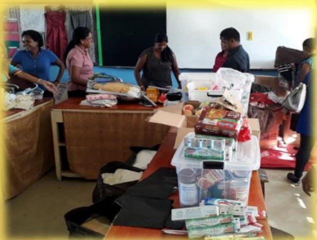
RELIEF ITEMS BEING SORTED OUT FOR DISTRIBUTION AT BA SANGAM COLLEGE