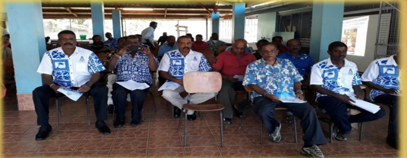
LAUTOKA TISI SANGAM AGM