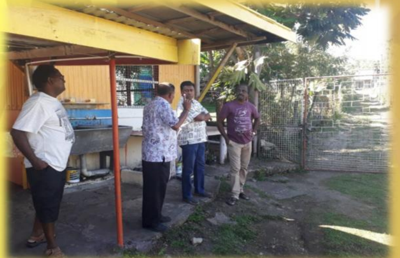
EXECUTIVES OF RIFLE RANGE TEMPLE IN DISCUSSION WITH THE SECRETARY GENERAL