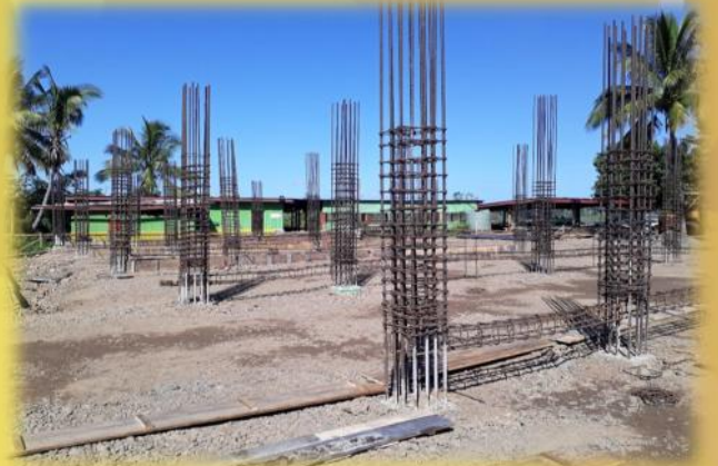
WORK PROGRESING AT THE SANGAM CULTURAL COMPLEX PROJECT