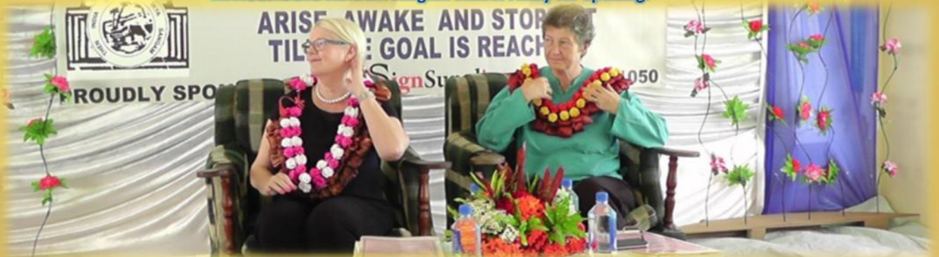
Official opening of Vunisamaloa sangam school after TCW