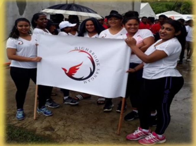
HIGHBROOK NETBALL TEAM FROM NEW ZEALAND