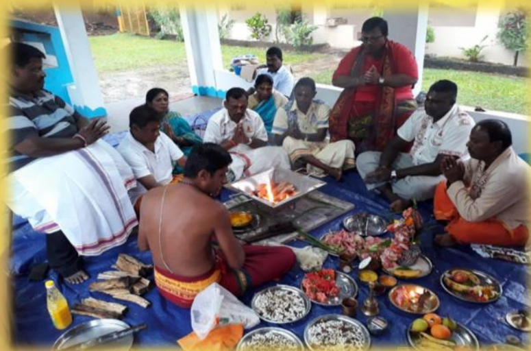
POOJA SEEKING BLESSINGS FOR A SUCCESSFUL CONVENTION IN NADROGA