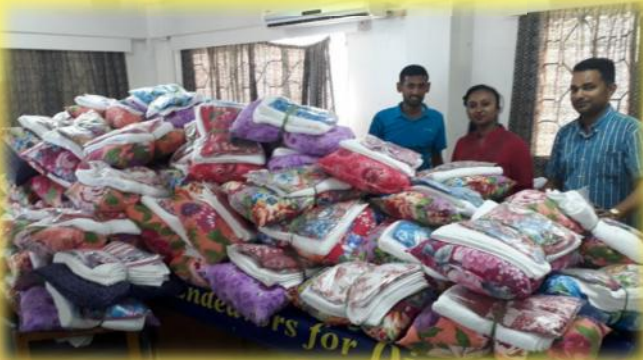
TISI SANGAM HEAD OFFICE PREPARING RELIEF SUPPLIES TO BE DISTRIBUTED BY SANGAM FIJI FOUNDATION TO FLOOD AFFECTED FAMILIES IN BA