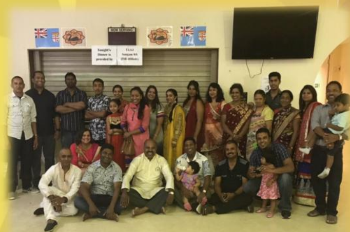
PERTH SANGAM CELEBRATING MAHA SHIV RATRI