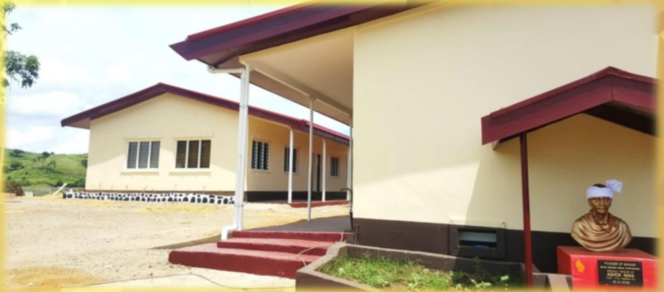
Reconstructed Raviravi sangam school ready for opening.

All schools are operating smoothly and they will be visited by the Education Board during June/July. The common trial examinations for the Sangam schools will continue as well as visits by the Head Office for the Mid-Term audits.