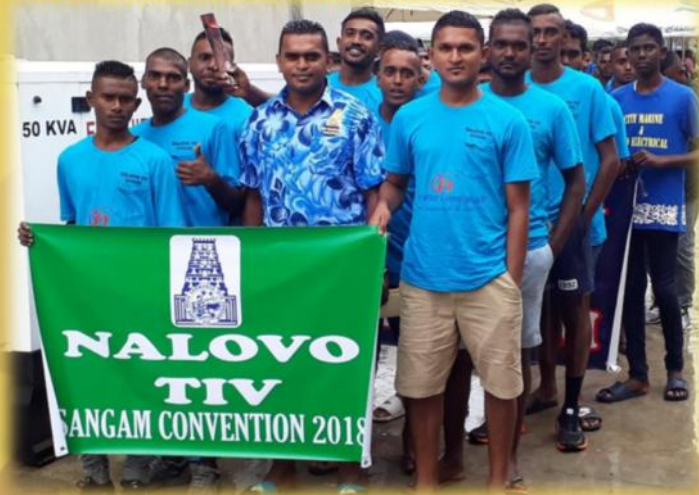
TIV SOCCER TEAMS