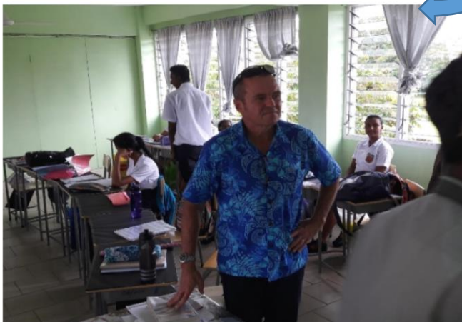
HIS EXCELLENCY THE HIGH COMMISSIONER OF AUSTRALIA VISITING NADI SKM COLLEGE