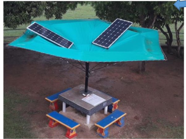
RAIN HARVESTING AND SOLAR POWER PROJECT @NADI SKM COLLEGE