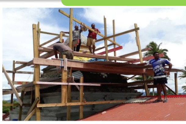
RENOVATION WORKS AT THE NAVUA SANGAM TEMPLE