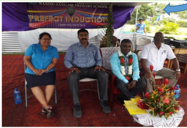
PREFECTS INDUCTION @ NASINU SANGAM PRIMARY SCHOOL