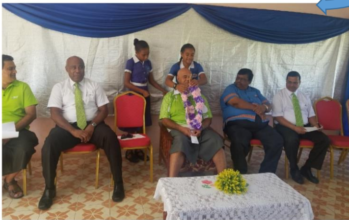
OFFICIAL LAUNCHING OF THE NADROGA SANGAM ECE CENTER BY BSP