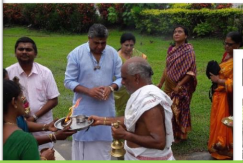
THE AUSTRALIAN HIGH COMMISSIONER AT THE NADI TEMPLE DURING THAIPOOSAM