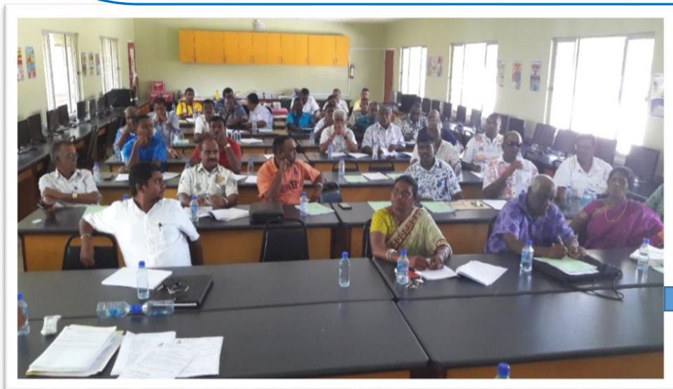
COUNCIL OF MANAGEMENT MEETING IN PROGRESS 28 TH JANUARY, 2018 @ NADI SSKMC

2018 will be a year to remember with several projects and new accomplishments for Sangam and we all should be looking for a very progressive future for the TISI Sangam Fiji.