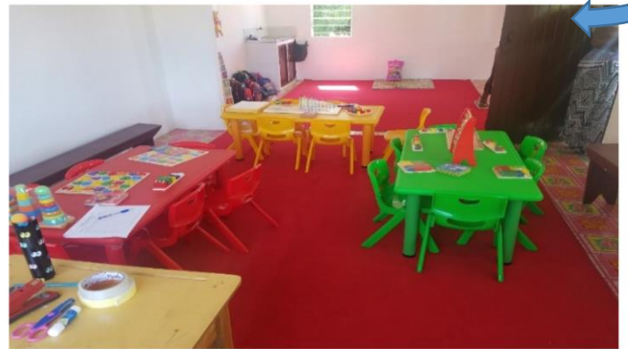
NEW ECE CENTER AT NADROGA SANGAM PRIMARY SCHOOL