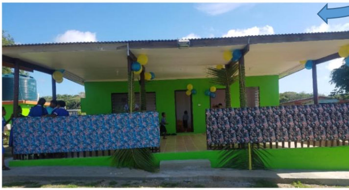
NADROGA SANGAM NEWLY ESTABLISHED ECE CENTER