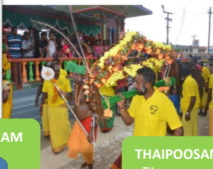
THAIPOOSAM COMING TO AN END ON SUNDAY 4TH FEBRUARY