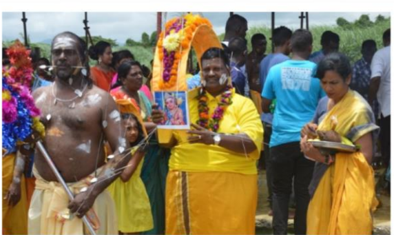
PREPARATION FOR MAHA KUMBHABHISHEKAM AT THE LABASA TEMPLE